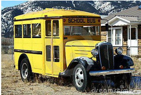
Aging Bus Fleet